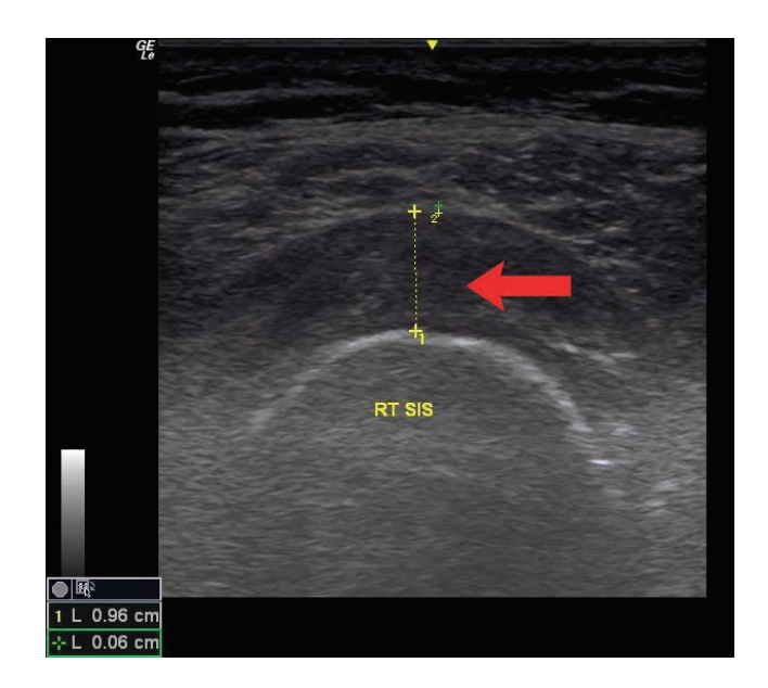
Figure 2 Illustration of supraspinatus tendinosis with probe positioned in the short axis