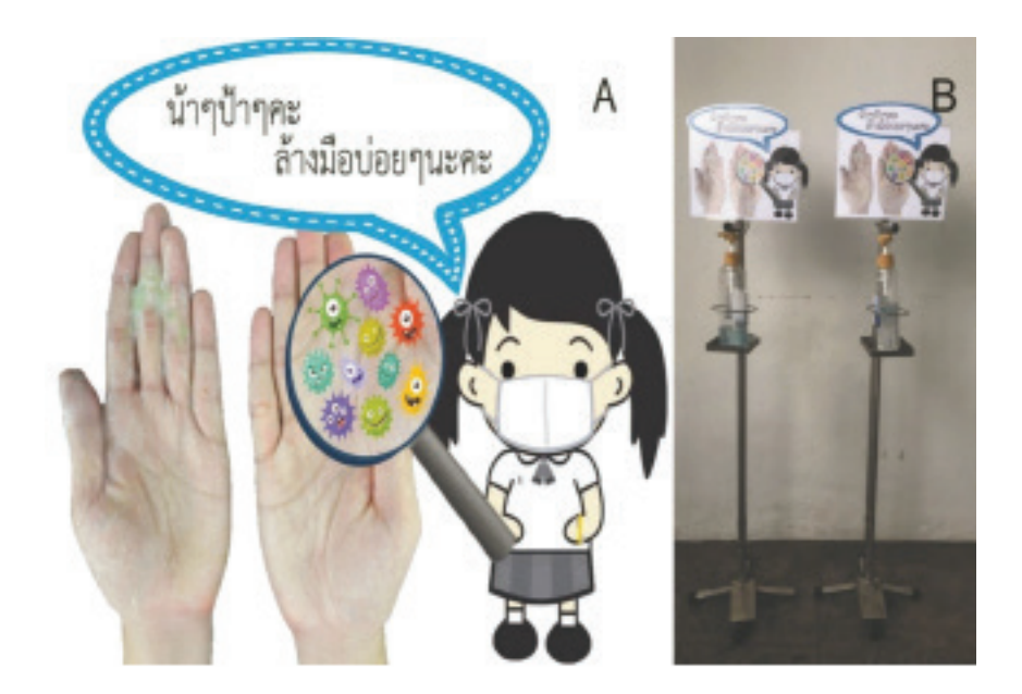
Remark: translation of the word balloon: "Aunties, uncles, please wash your hands often!"