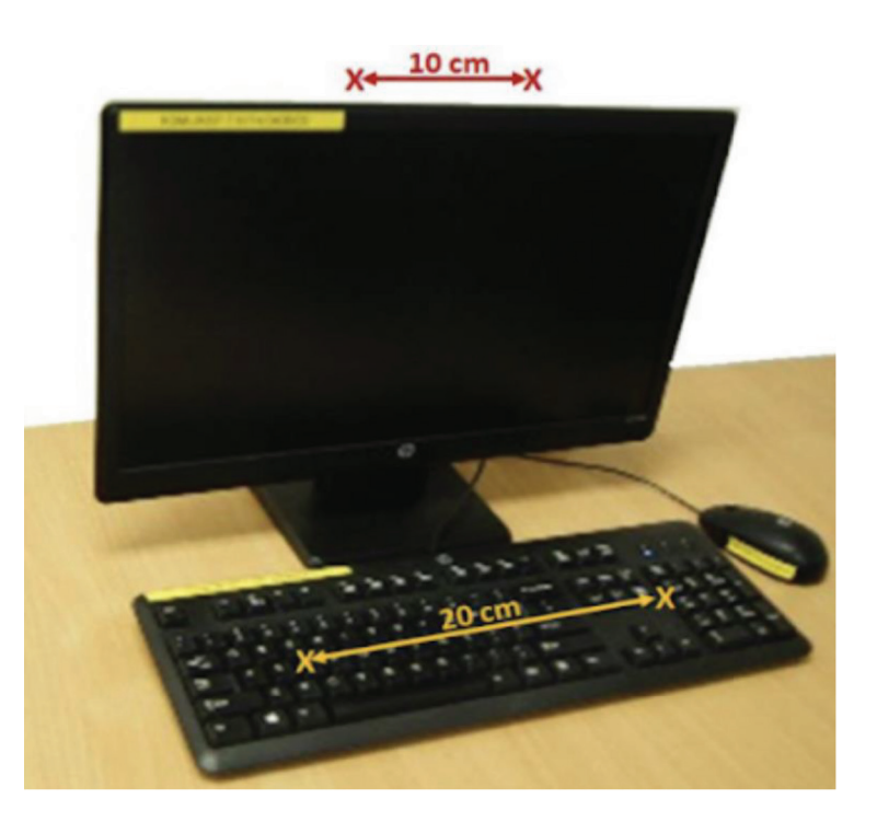
Figure 2 Measurement points for a computer workstation