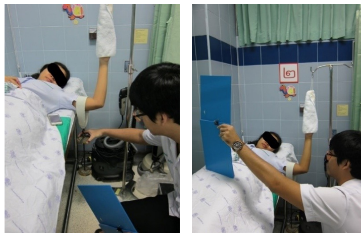
Figure 2 Testing and measurement method

Thirty volunteers were tested, 13 men 17 women. The mean age of the volunteers was 30.3 years, and the mean body mass index was 24.3 kg/m 2 . Twenty-six were right-hand dominant and 4 were left-hand dominant (Table 1). All volunteers tested both types of finger trap two weeks apart. Overall, the bamboo finger trap group had lower VAS pain scores than the stainless steel finger trap