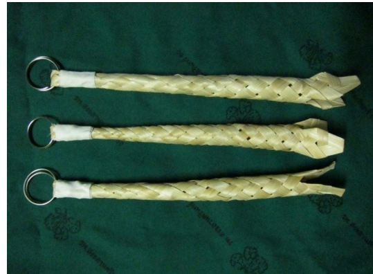
Figure 1 Bamboo–trunk finger trap

The purpose of this study was to compare pain scores between the bamboo finger trap and the stainless steel finger trap. The hypothesis was that there would be differences in associated finger pain scores between two types of devices in volunteers.