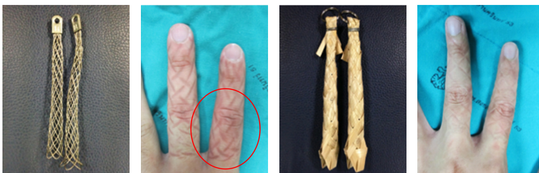
Figure 3 A complication from the metal finger is superficial skin ablation

VAS=visual analog score, S.D.=standard deviation