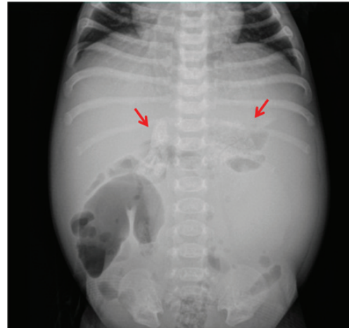
Figure 1 Plain film abdomen, note bilateral adrenal calcification

per deciliter (mg/dL), albumin 2.9, and globulin 3.6 grams per deciliter (g/dL).