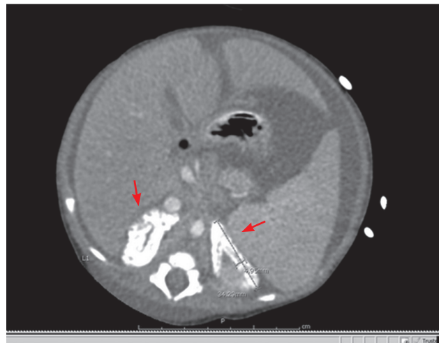
Figure 2 Computed tomography of the abdomen, note bilateral adrenal calcification

Investigations for an intrauterine infection were negative for toxoplasmosis, cytomegalovirus, rubella and herpes simplex viruses. A plain film of the abdomen showed calcification at both adrenal glands (Figure 1), which was confirmed by computed tomography (Figure 2). A dried