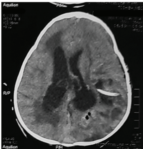
Figure 2 The head's postoperative computed tomography scan showed a massive reduction in abscess size, with intracapsular drainage inserted into the abscess capsule. The midline shift is no longer visible, and the left lateral ventricle was released from the pressure.

The patient then underwent a contrast-enhanced CT scan of the head that revealed multiple cystic lesions with ring enhancement in the left frontotemporoparietal region. The right lateral, third and fourth ventricles were also dilated with periventricular edema (Figure 1). We decided to perform a small craniotomy to evacuate the open abscess, and to install intracapsular drainage. The patient received pre-operative antibiotics of Cefazoline 1 gr. A postoperative CT scan of the head showed a reduction in the abscess size between the inserted intracapsular canals in the correct position (Figure 2).