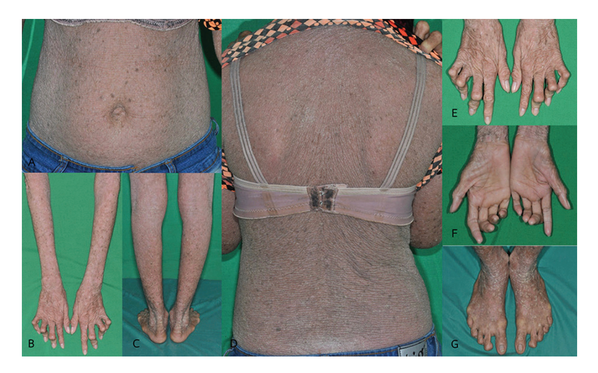
Figure 1 Epidermolytic ichthyosis. (A–D) Widespread scaly brownish hyperkeratosis and multiple lentigines are noted. (E–G) Contraction deformity affected fingers and toes.

A 39-year-old woman presented with generalized erythroderma and desquamation since birth. Later in life, she developed generalized marked hyperkeratosis without palmoplantar keratoderma. The patient and her parents had no history of skin blistering at birth. The affected skin was thick and darkened, and accentuated creases had formed over time. She was unable to fully extend her fingers and toes. To her knowledge, she had no family history of similar skin conditions. Physical examination revealed generalized scaly hyperkeratotic plaques over the face, trunk, and extremities, with skin crease accentuation over the joints and body folds. There were no blisters, erosion, or ectropion/eclabium on the periorificial skin.